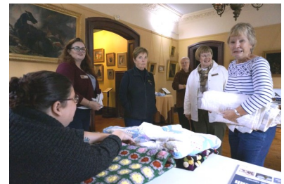
Preserving family heirlooms at Glanmore National Historic Site