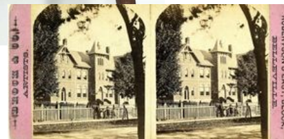
of the Belleville High School/Queen Victoria School on Church Street