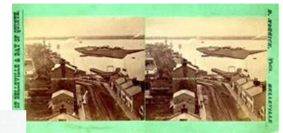
CABHC: HC 4502 Stereoscopic view by David Morrice looking south from City (then Town) Hall in 1877