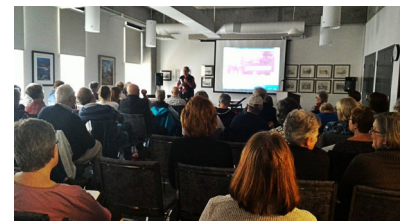
Family History Day at Belleville Public Library