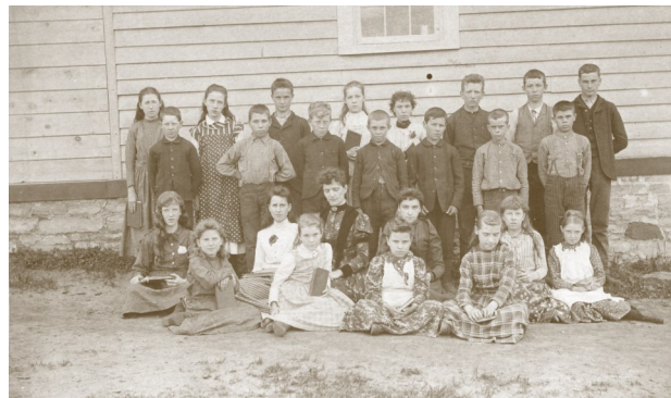
Children and teacher at Queensborough School, c.1890