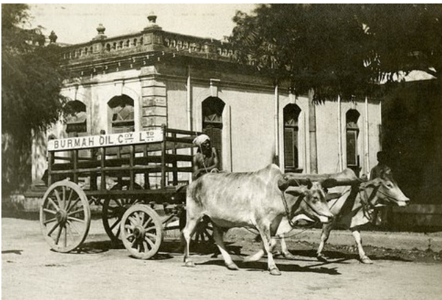
Burmah Oil Company cart in Yangon, Myanmar (then known as Rangoon, Burma)

In 2010, the Community Archives was given a photograph album which recorded the band members' two years on tour. They provide a fascinating glimpse of the Edwardian era in a range of different countries, at a time when motor vehicles were just beginning to replace horses and oxen.