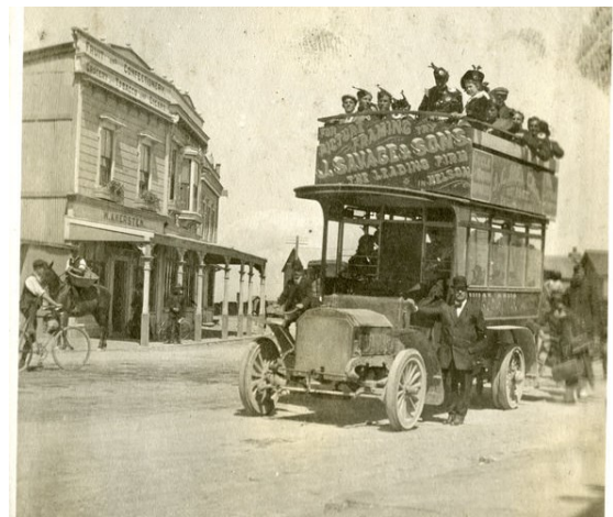
CABHC: HC06335 Page 32, Image 2 (detail) Members of the Kilties on a motor bus in Nelson, New Zealand

This collection of photographs has much to teach us about early twentieth century travel and tourism, as well as about the different countries and cities the Kilties visited. The images from the album have all now been digitized and are available online through our Flickr account at https://flic.kr/s/aHsm1rsZLK .