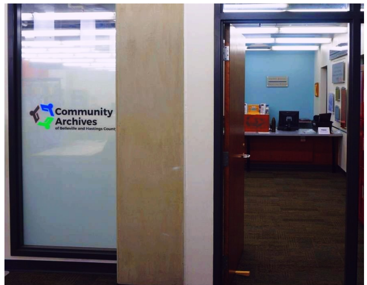
Open Door at the Community Archives

www.doorsopenontario.on.ca/en/belleville